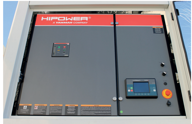
HIPOWER® COMAP IntelliGen NT Control Panel

Alternator alarms included: Overload, unbalanced voltage, over voltage, under voltage, over frequency, under frequency, short circuit, reverse power, and incorrect phase sequence.